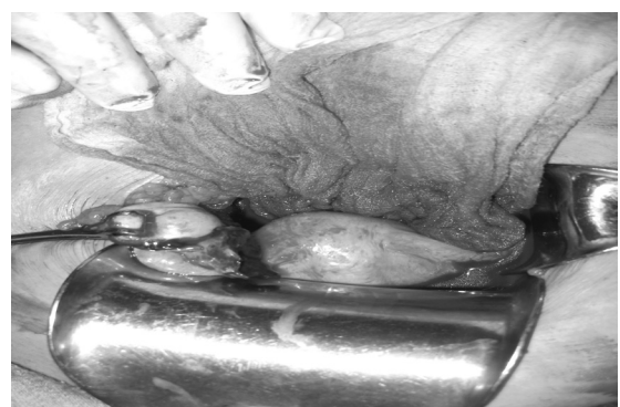
Fig1. Showing ruptured right sided ectopic pregnancy.