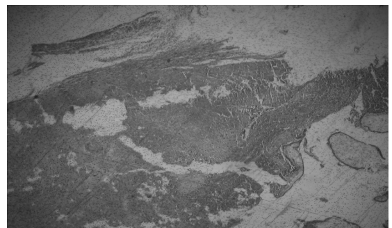
Fig 3. Also showing ovarian parenchyma containing blood clots with both trophoblastic tissues and chorionic villi.

origin. There may also be chance of involvement of ovary following tubal abortion. The first reported case in the literature was from Saint Maurice of France in 1682.<sup>3</sup> This primary ovarian pregnancy is regarded as rare case in medical literature but somehow nowadays it seems to be more frequent because of the use of intrauterine contraceptive devices.<sup>4</sup>