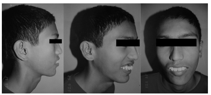
Figure 2a-c. Pretreatment extra oral photographs.