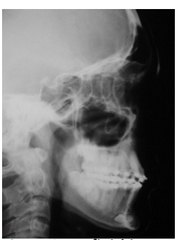
Figure 8. Prefinishing Lateral Cephalogram.