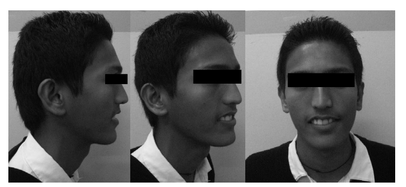
Figure 6. Posttreatment extra oral photographs.