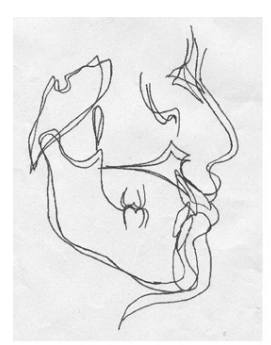
Figure 9. Overall Superimposition on Ba – Na plane at CC point of the pre-(Black) and prefinishing (red) cephalograms.