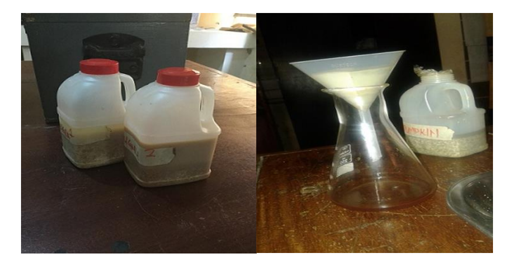
Plate 4. Soaking method process Plate 5. Filtration/clarification

in an oven dryer at a temperature of 70^{0} C. The procedure is repeated for each of the varieties. Plate 4 and 5 show the apparatus for soaking method and filtration/clarification method.