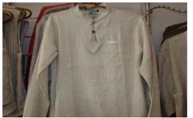
Fig. 9. Shirt