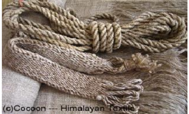
Fig. 3. Head-strap (Namlo)