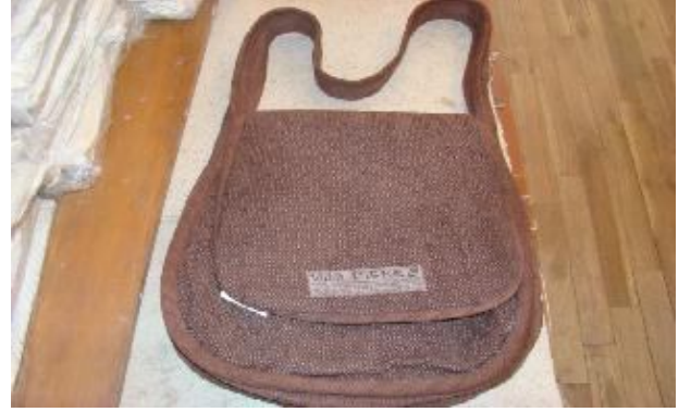
Fig. 7. Satchel