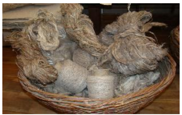
Fig. 10. Yarn spools for weaving