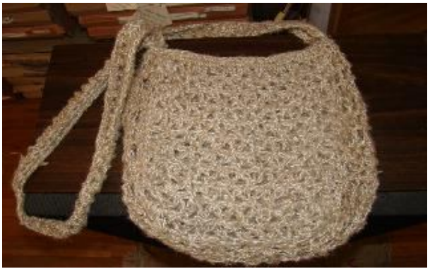
Fig. 8. Ladies handbag