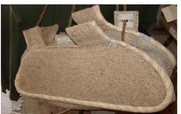
Fig. 6. Ladies handbag