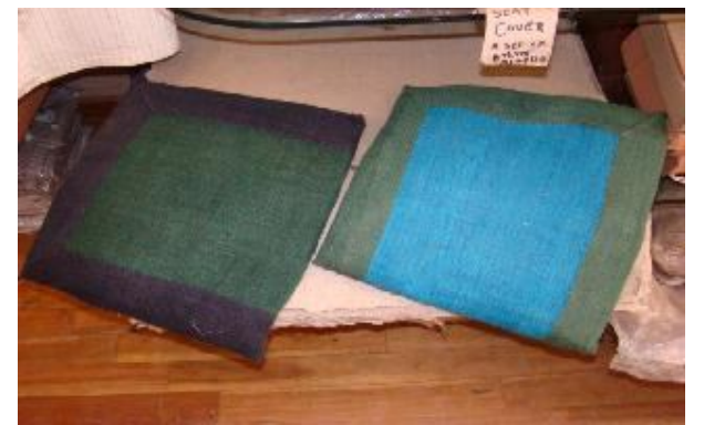
Fig. 5. Cushion covers

KATHMANDU UNIVERSITY JOURNAL OF SCIENCE, ENGINEERING AND TECHNOLOGY VOL. 5, No. I, JANUARY, 2009, pp 136-142.