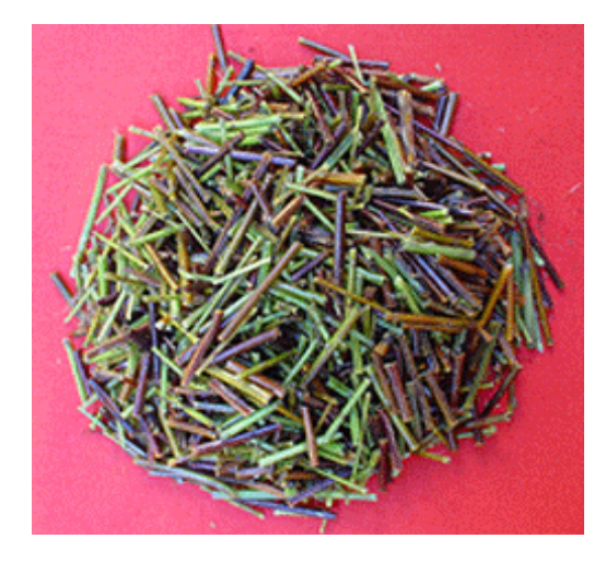
Figure 6. Rachis