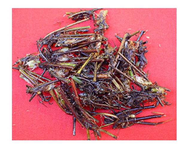
Figure 5. Rhizome