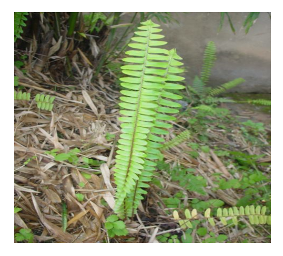
Figure2. Nephrolepis cordifolia, entire plant

KATHMANDU UNIVERSITY JOURNAL OF SCIENCE, ENGINEERING AND TECHNOLOGY VOL. I, No. V, SEPTEMBER 2008, pp 68-72.