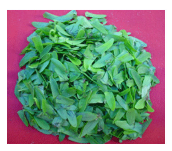
Figure 7. Leaflets