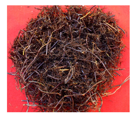
Figure 4. Roots

Figure2. Nephrolepis cordifolia, entire plant