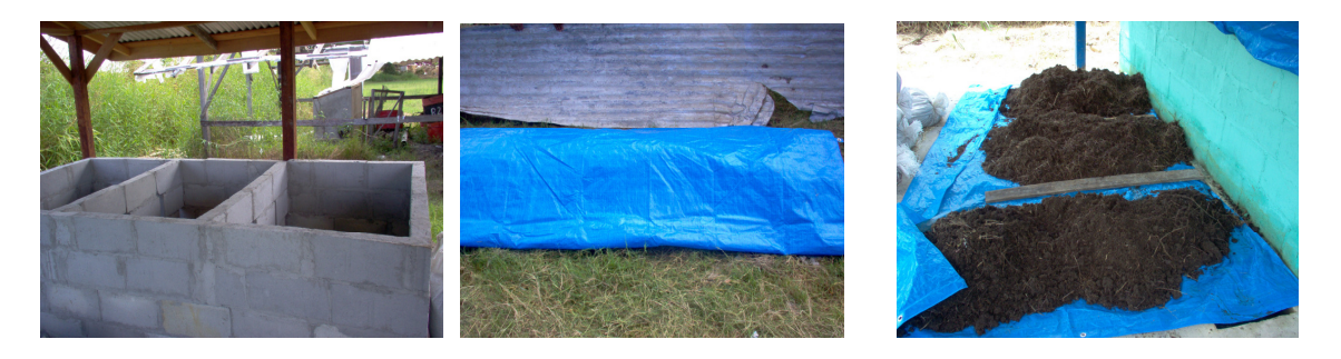
Fig. 1 Vermiculture tanks Fig. 2 Biodung composting unit Fig. 7

Biodung composting units were set up (in triplicate), by using the combination of water hyacinth and grasses (Fig 2). The biodung composting were turned after 15 days and were transferred to respective vermitech units after total time period of 30 days for further processing and vermicomposting. During march, 2007, vermicompost from the three tanks was harvested (Fig 3).