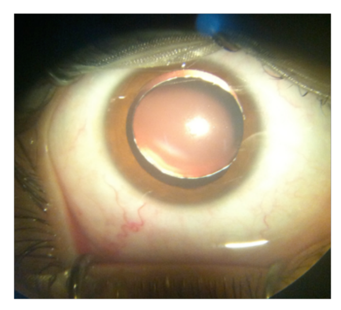
Figure 2: Microspherophakia with visible zonules

was 4.45 mm in right eye and 4.42 mm in left eye (normal crystalline lens thickness is 3.30 to 3.96 mm). The edges of the lens could be seen and there was no subluxation of lens in both eyes.