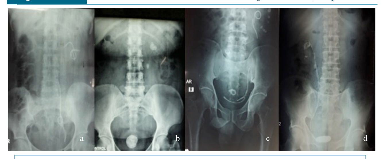
Fig 1. KUB images of forgotten stents (a) One year (b) Three years (c) Seven years (d) 10 years

patients presented to us within one year and five patients reported after one year. Stent syndrome was mode of presentation in 74% followed by encrustation or stone formation in 29.5% and urinary tract infection in 15%. Urinary bladder was the common site of encrustation (59.2%). We used multimodality approach for management of the forgotten stents (Table 1). Majority (92.5%) of the patients were managed with endourological approach and 26% (seven) of cases required more than one modalities of treatment.