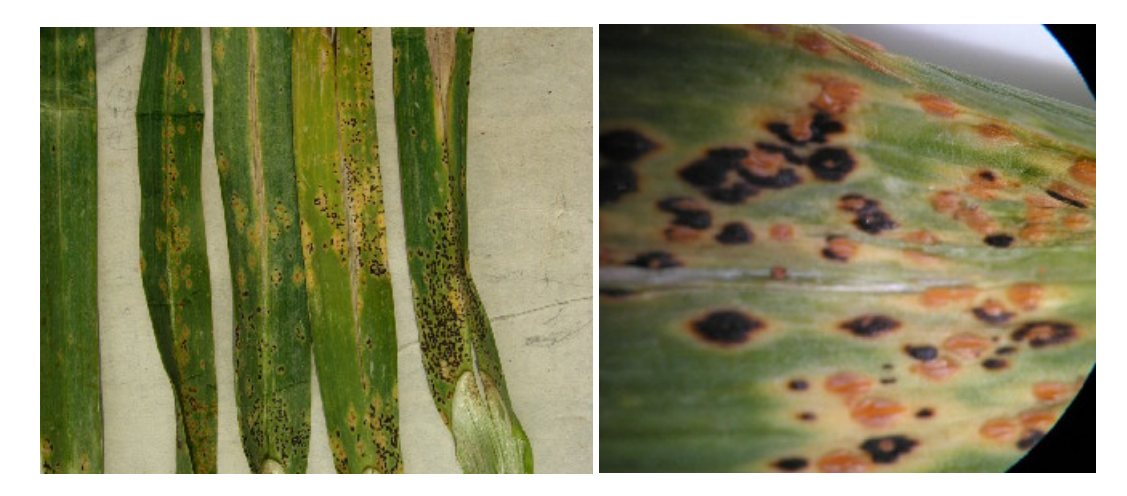
Figure 1. Garlic leaf rust caused by Puccinia porri, a. leaf segments showing rust pustules, b. Teleutosori and uredosori.