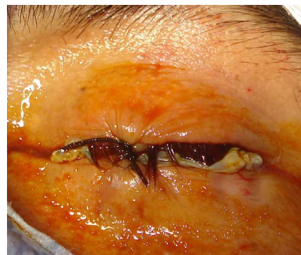
Figure 3: Photograph at completion of surgery with both lid sutures tied to each other to keep conformer and amniotic membrane in place.