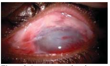
Figure 3: 1st postoperative photograph showing limbal allograft in superior and inferior aspect with overlying amniotic membrane.

After the procurement of amniotic membrane, it was placed on a filter paper and preserved in 100% glycerin for 3 months. Intra-operatively amniotic membrane was placed over the cornea, with stromal side of the amniotic membrane facing towards the epithelium of the recipient. Six interrupted and circumferential 10-0 nylon sutures were placed in the kerato limbal junction. The remaining amniotic membrane flap was sutured in the conjunctiva with interrupted 8-0 vicryl sutures.