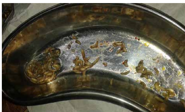
Figure 2: Retrieved maggots from the wounds