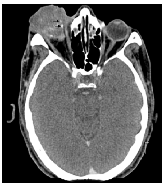
Figure 2: Computed Tomography of the orbit showing a heterogenous lesion replacing the eyeball completely with few calcific foci within (black arrows), causing proptosis of the right eye. Also seen is a thinner optic nerve (when compared to the other side) with a nodular extension of the lesion (white arrows)