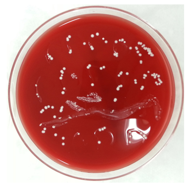
Figure 1: Multiple small, chalky, white colonies on sheep blood agar after four days.