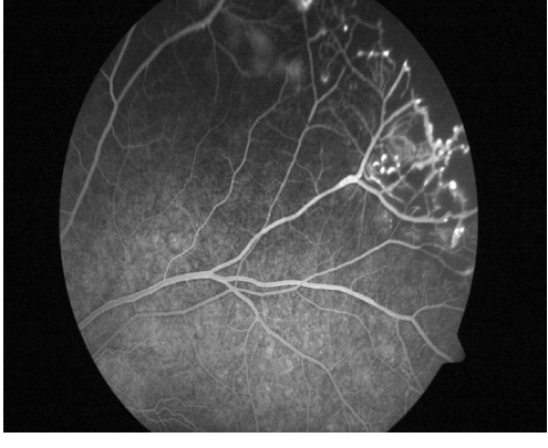
Figure 3: Left eye FA showing macroaneurysms and vascular leakage during late phase

During the venous phase delayed filling of the retinal macroaneurysm with fluorescien dye was seen. The aneurysm was obscured partially by the presence of hemorrhage, but filling by the dye enhanced visualization (Figure 3).