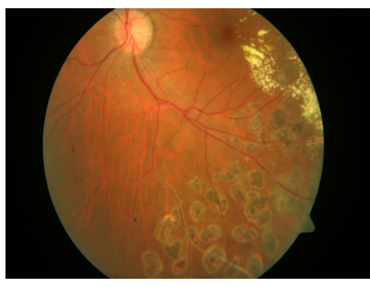
Figure 4: Fundus picture of left eye showing laser spots after modified grid laser photocoagulation