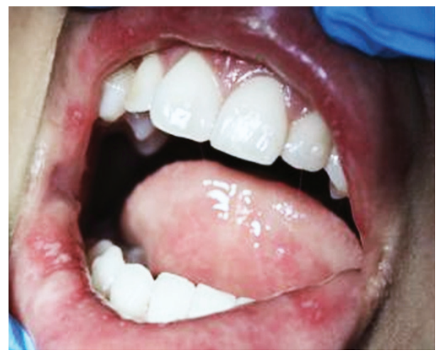
Figure 1 A: Oral ulcers at the time of diagnosis.

was under control and topical medications were tapered. After 6 months, patient underwent uneventful phacoemulsification with posterior chamber intraocular lens with pars plana vitrectomy with endolaser in left eye, along with perioperative coverage of oral steroids. Regular OCT was done every 3-6 monthly