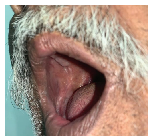
Figure 2: Donor site photograph.

(e) Vascularized base reinforced with buccal mucosal graft and secured with absorbable sutures.