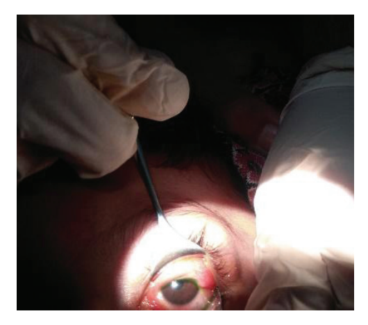
Figure 3 and 4: After 3 days of initiation of Intravenous antibiotics and fortified medications.