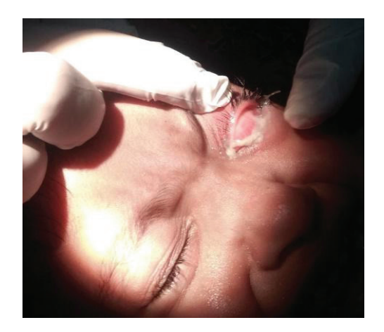
Figure 1 and 2: A profuse mucopurulent discharge on the left eye with redness and swelling.