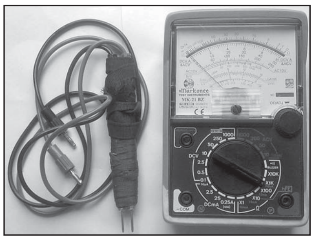
Fig 1: Xerosis Meter , a sensitive analog galvanometer.

Xerosis Meter is a sensitive analog galvanometer (Fig. 1), the property of which has been exploited to be used in diagnosing dry eye. It can measure resistance in a range of 0 - 20 Mega ohms.