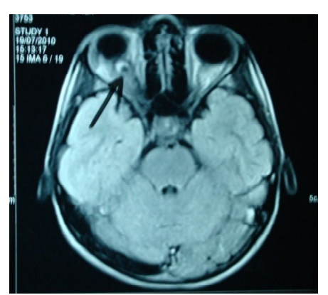
Figure 2(B): T1 weiged MRI axial scan of brain and orbit.

There was a mass with iso signal intensity in T1 and mixed signal intensity in T2. Oval T2 high signal intensity area was noted within the mass in anterior aspect suggestive of inflammatory pathology probably of cysticercosis.