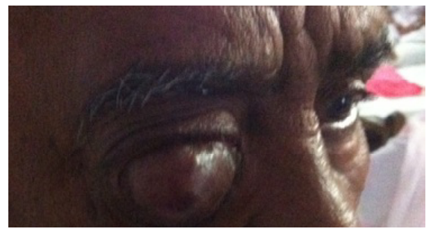
Figure 1: Showing the large swelling in the right eye.

A 65-year-old gentleman presented with a large, pedunculated swelling arising from the right pthisical eyeball which had developed during the past one and a half years. The patient correlated its occurrence with a minor trauma to the right pthisical eyeball one and a half years back, following which he noticed a small nodule which was painless and gradually progressed to the present extent of approximately 4 x 3 cm mass (Figure 1).