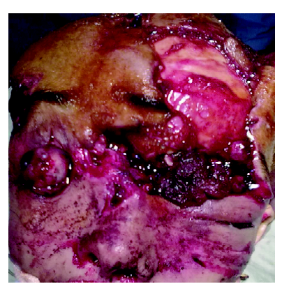
Figure 1: Picture showing loss of the left eye, complete scalp avulsion and avulsed right eye

The left globe was prolapsed with partial loss of its contents while the right globe was crushed by the fractured orbit (Figure 2). There was a large scalpskull defect with herniating brain matter over the right frontal area. The CT showed extensive fractures of the anterior skull base and of both the orbits. Primary ABC management along with blood transfusion was done and the patient was kept on a ventilator. The patient party did not consent to neurosurgical/ophthalmological intervention in this case, and despite all efforts, he succumbed to the severe head injury and expired on the fourth day.