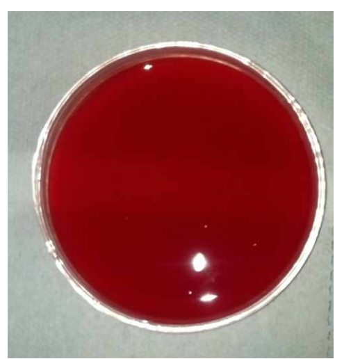
Figure 4: Blood Agar Plate