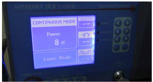
Figure 1: Lazer Machine