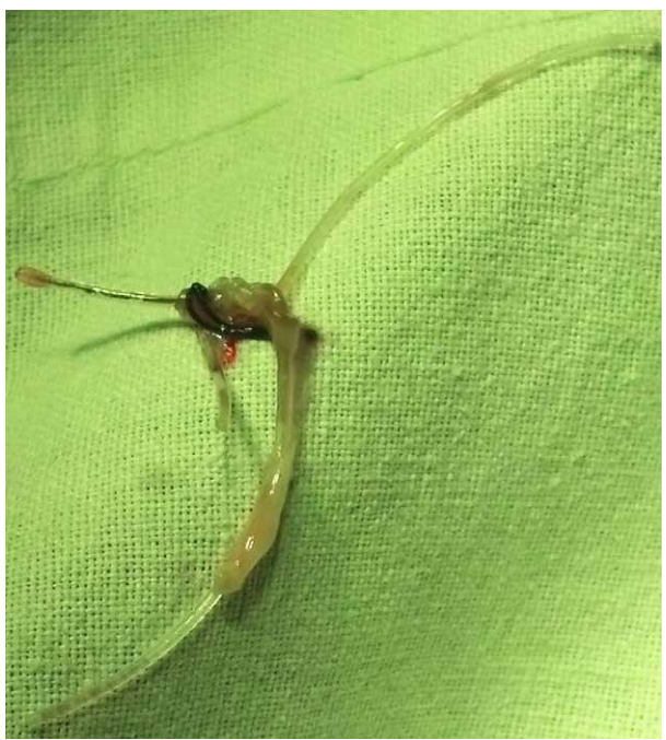
Figure 3: Removed Silicone Tube