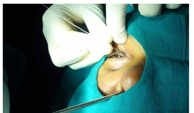
Figure 2: Patient with laser probe and nasal endoscope in situ