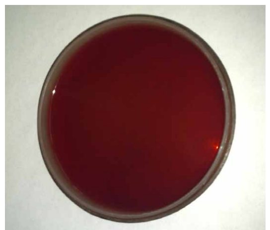
Figure 5: MacConkey's Agar Plate