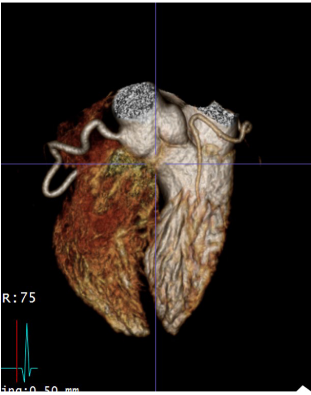
Figure 2: 3D Volume rendered image showing the deficient normal anatomy of the left main artery.