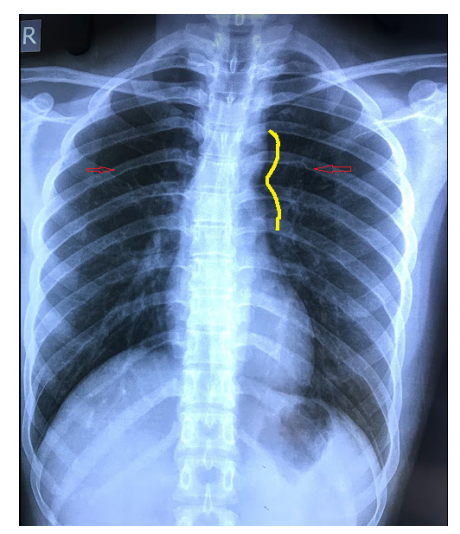
Figure 1: chest X-ray showing the "figure 3 sign" formed by the aortic nob, the stenotic segment and the post stenotic dilatation of aorta suggesting CoA (yellow line). The red arrow shows the notching in the inferior border of the ribs bilaterally caused by the presence of dilated intercostal collateral arteries.