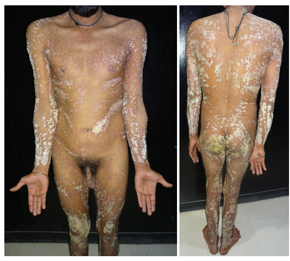
Figure 1, 2: Multiple erythematous linear scaly plaques on the body along the lines of blaschko