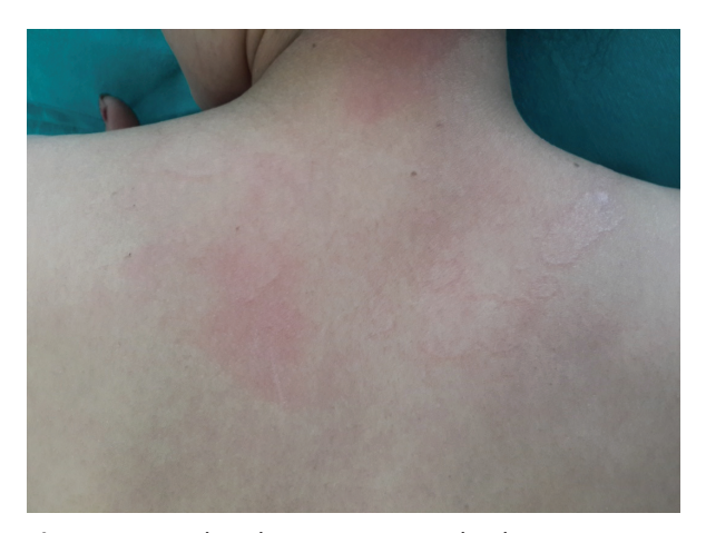
Figure 1: Annular plaques on upper back

The patient was followed up for three months advised with strict photoprotection and intermittent topical steroid use which reduced patient's itching but no improvement on the appearance of the skin lesions. However the number of skin lesions did not increase.