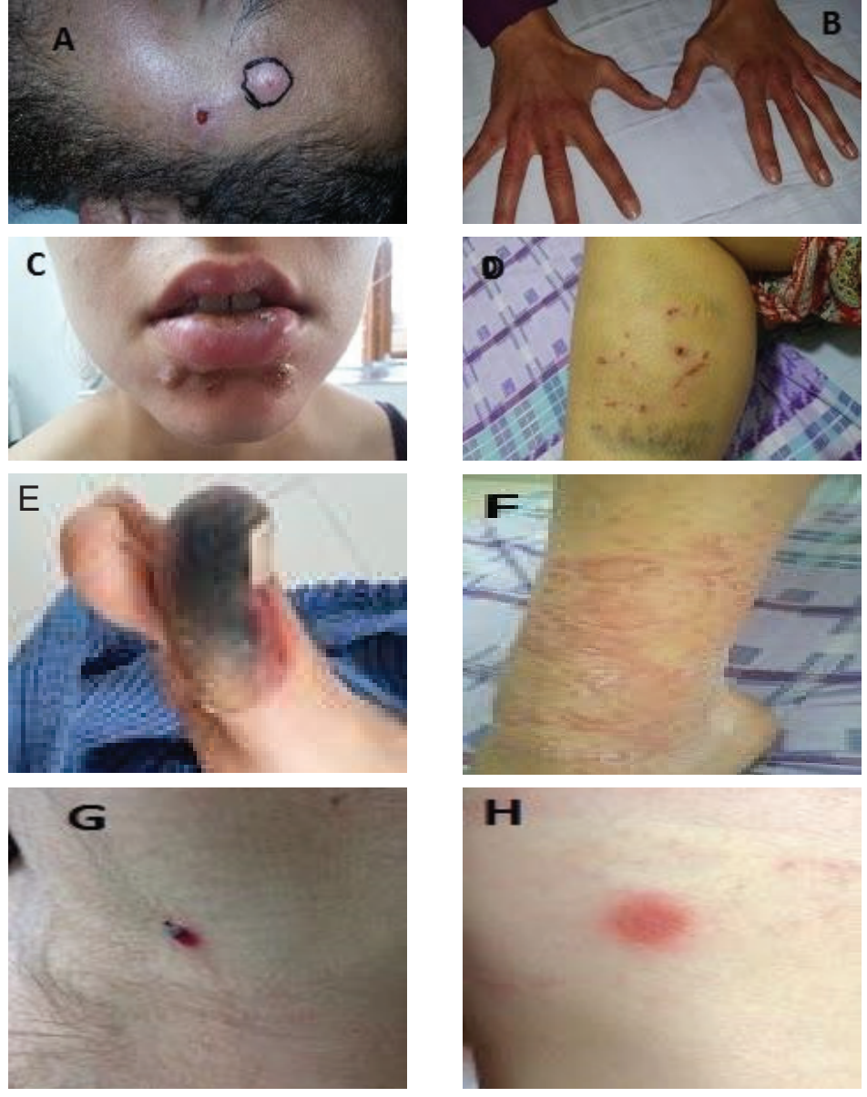
Figure 1 (A) Staphylococus aureus Cellulitis. (B) Chilblains. (C) Herpes Simplex type 1 infection in 22 years old traveler. (D) Dog bite on right leg in 24 year old female traveler. (E) Frostbite on the big toe of 57 year old traveler. (F) Urticarial rash on 23 year old female traveler. (G) Tick seen crawling on armpit on a traveller returning from Chitwan jungle of Nepal. (H) Tick bite lesion on a 34 year old female traveler.