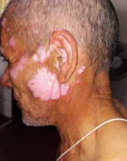
Figure 2: Multiple DLE plaques over left cheek, ear, behind ear and forehead