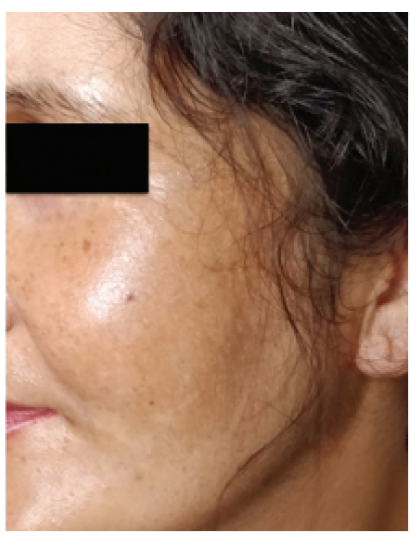
A (Clinical image) Distribution of melasma over left cheek.tif