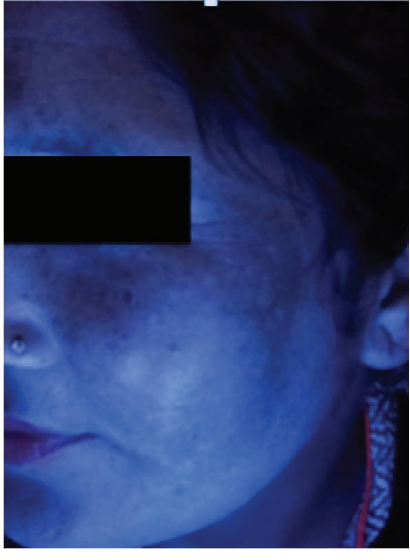
B (Wood's lamp image) No accentuation of pigment over central cheek and accentuation of pigment over periphery.tif