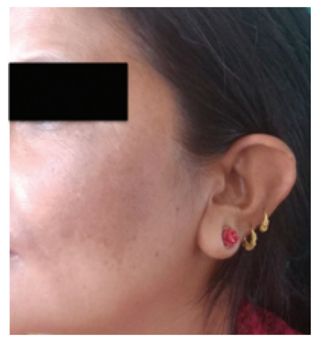
A (Clinical image) Distribution of melasma over left malar region.tif

At the same time, patients having a higher MELASQOL score should also be offered psychological counselling. Also, patients should be involved actively in the decisions concerning their treatment. Discussing the patient's concerns, expectations and treatment can also empower the patient. This way, we can treat the patient as a whole- physically and psychologically.