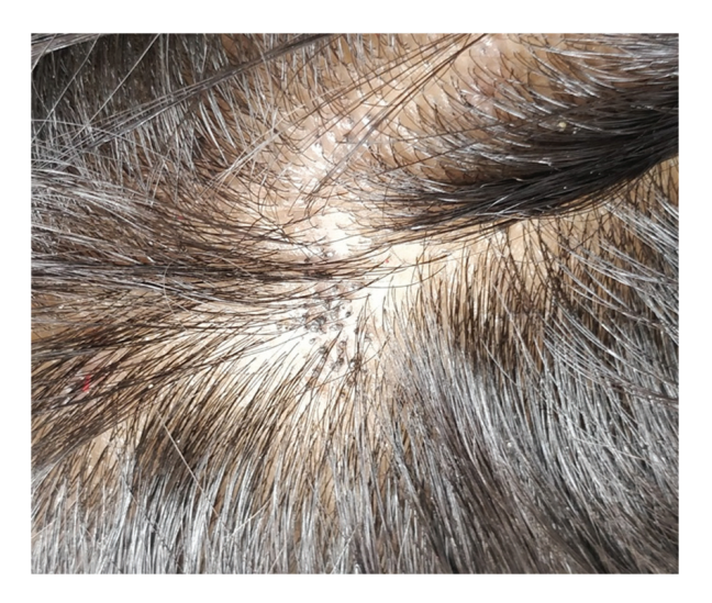
Figure 1: Black dots on the scalp