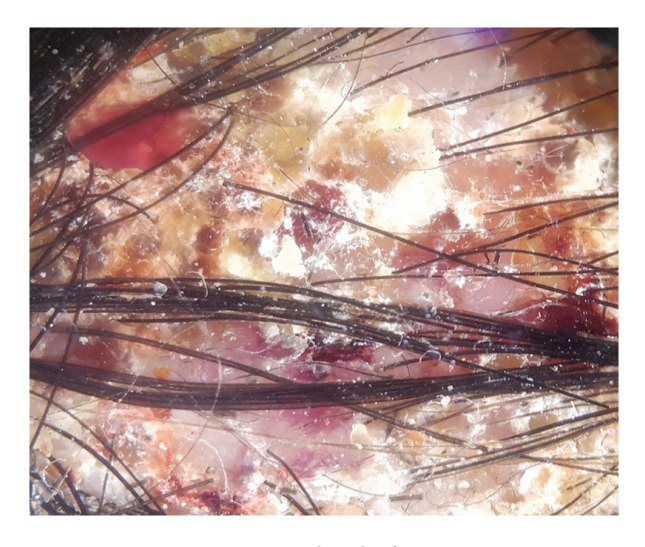
Figure 2: Trichoscopy (x10) of kerion showing yellowish and hemorrhagic crusts