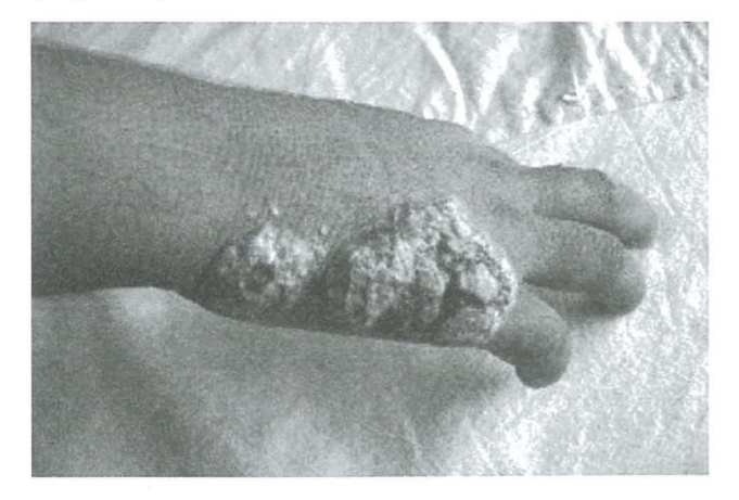
Figure 1. Violaceous plaque with central crusting & stellar fissures on back of hand

On examination there was a single well-defined faintly violaceous rough plaque on the ulnar side of the back of right hand( size- 5x5 cm) with central crusting and stellate fissuring which was exuding serosanguinous discharge. A smaller but similar lesion was also present (size-2.5x2cm) adjacent to the confluent lesion near the wrist (Figure 1).