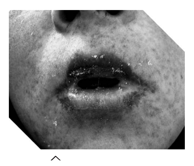
Fig. 1 Note the crusting of lips, adhesions, decreased mouth opening and discharges present

Till date no SJS has been reported to occur due to the ingestion of Nimesulide tablets in any medical literature to the best of our knowledge. The easy availability of this drug as an over the counter medication for any form of headache, myalgias, arthralgias in developing nation like ours, care should be taken by the treating physician of its possible reaction while prescribing the drug and to regard it as the possible cause for the drug reactions that follow in a patient especially if the etiology is regarded as unknown till then.