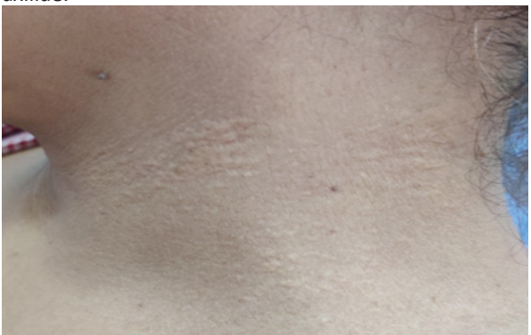
Figure 3: Few yellowish papules scattered over lateral surface of neck of patient's elder sister.