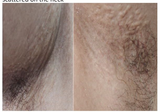
Figure 2: Yellowish papules scattered around bilateral axillae.