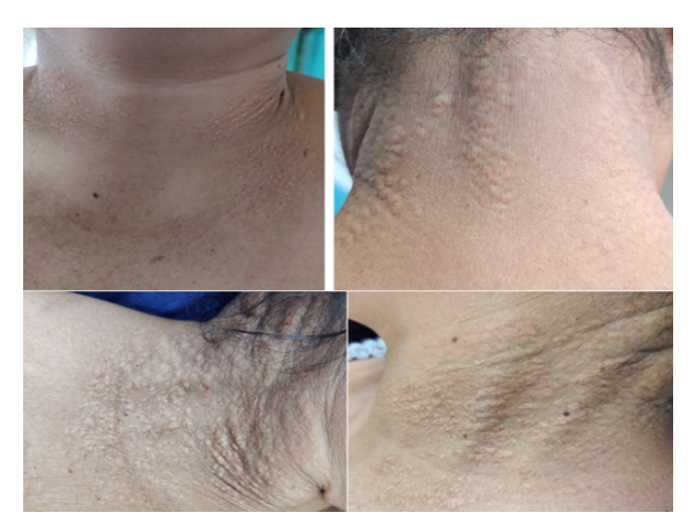
Figure 1: Yellowish papules coalescing to form plaque scattered on the neck