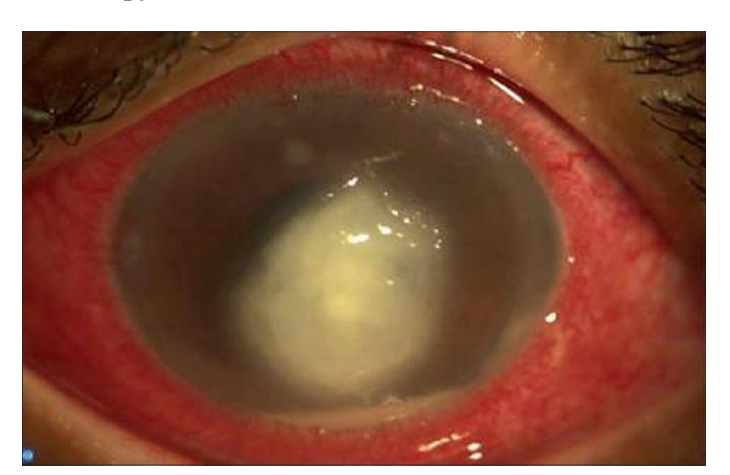
Fig-4: Corneal fungal abscess at periphery with infiltration in slit-lamp microscopy.