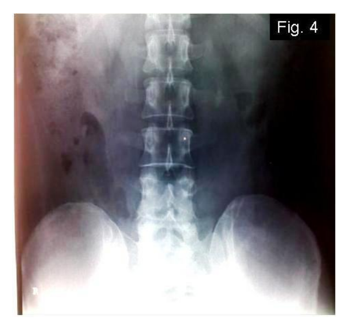
Fig. 4: Plain X- ray urinary tract shows smaller size and lower positioning of the stone at the level of the transverse process of the third lumber vertebra.

Patient underwent ESWL (Siemens Modularis Lithotriptor) on 21<sup>st</sup> July 2009. A total of 3100 number of shock waves with a maximum energy of 3.5 and a mean energy of 2.9 were delivered in the first session. Plain X- ray of urinary tract was done on 26<sup>th</sup> July 2009 as part of follow up procedure which showed partial fragmentation of the stone which was seen lodged in the ureter adjacent to the transverse process of the third lumbar vertebra (Fig. 4).