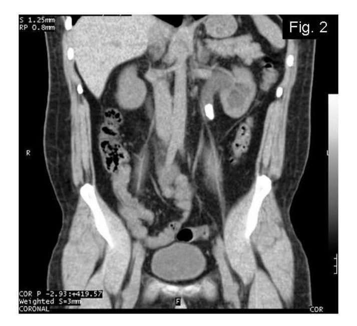
Fig 2: Multi detector CT scan without contrast reveled 2.2cm stone at proximal segment of left ureter with moderate pelvicalyceal and proximal ureteric dilatation.