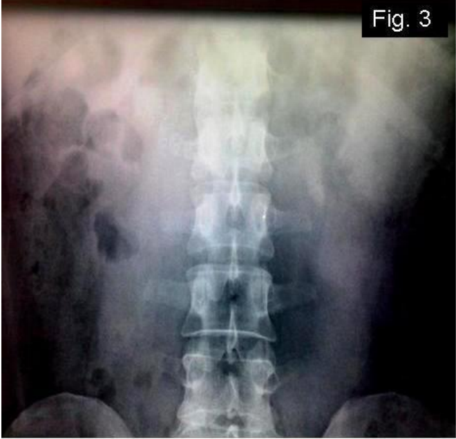
Fig.3: 16<sup>th</sup> July 2009 plain X-ray of urinary tract showing an oval shaped faintly opaque calcular shadow along the course of proximal lumbar segment of left ureter just above the level of left transverse process of third lumbar vertebra.

Patient underwent ESWL (Siemens Modularis Lithotriptor) on 21<sup>st</sup> July 2009. A total of 3100 number of shock waves with a maximum energy of 3.5 and a mean energy of 2.9 were delivered in the first session. Plain X- ray of urinary tract was done on 26<sup>th</sup> July 2009 as part of follow up procedure which showed partial fragmentation of the stone which was seen lodged in the ureter adjacent to the transverse process of the third lumbar vertebra (Fig. 4).