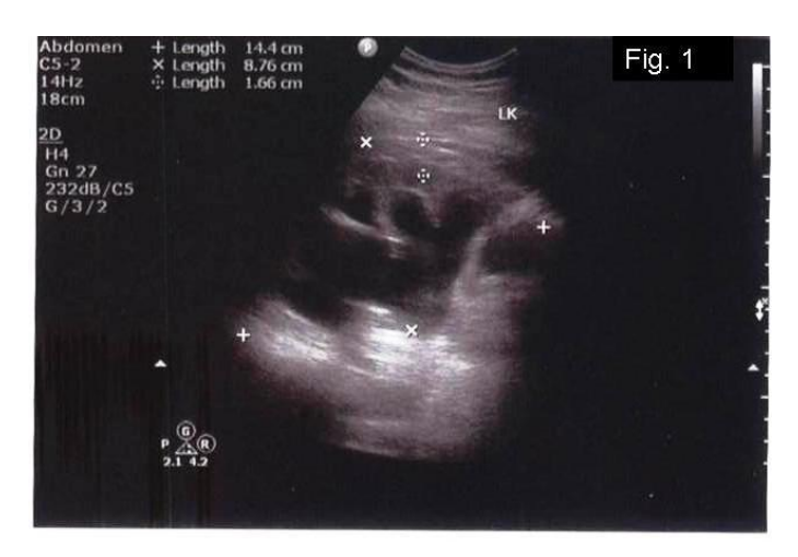
Fig 1: Ultrasound of abdomen and pelvis performed on 14<sup>th</sup> May 2009 showing an echogenic shadow at region of pelvi ureteric junction with no clear posterior shadowing with moderately dilated pelvicalyceal system.

Ultrasound of abdomen and pelvis performed on 14<sup>th</sup> May 2009 revealed eccogenic shadow at region of left pelviureteral junction with moderately dilated pelvi-calycial system (Fig 1). Multidector – CT scan without contrast showed an oval shaped stone in the upper left ureter of size 2.2 cm. (Fig 2). On 16<sup>th</sup> July 2009 plain X-ray of urinary track was taken revealed faint calcular shadow in the upper left ureter just above the level of left transverse process of third Lumbar vertebra measuring about 2.2 cm in size (Fig.3)