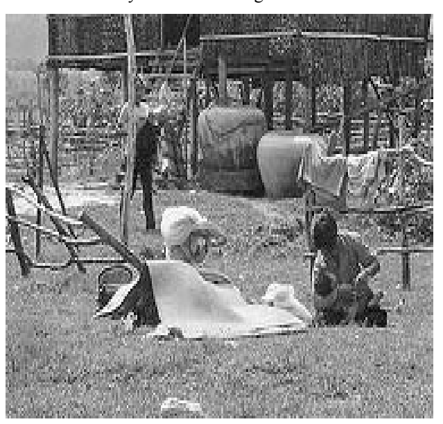
Figure 2, Evicted people under the open sky

At the same time, it has been observed that property right assurance is not the only means of uplifting of poor. Property rights are only means of recognition by the authority and society. As long as informal occupation is not contested, user can use it for livelihood and agriculture production as it happens in the rural areas of mountain (in Nepal, the author has observed it) where people use unregistered land for horticulture or wild plantation of economic value. Another observation is that the highly complex formalities required for land titling causes the poor to enhance the hardship and make ultimately less attentive derailing them to be out of the system and making them informal settler.