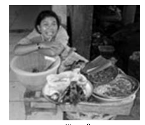
Figure 8 Example of micro-business by credit accessed from cooperatives