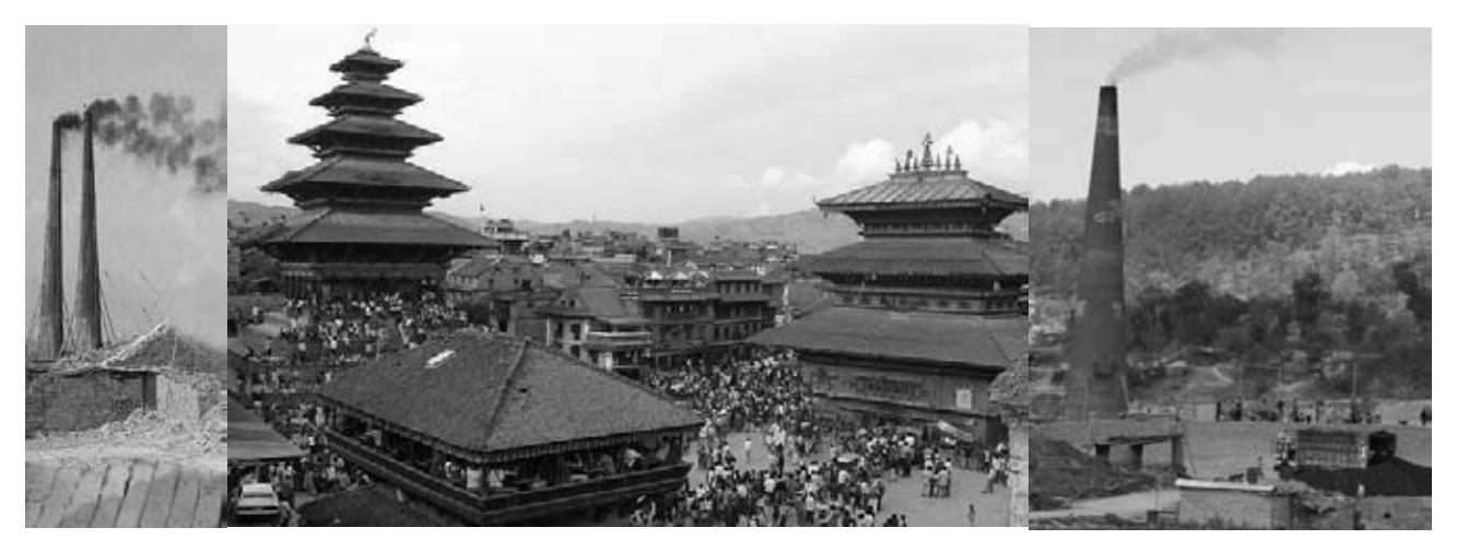
Figure 11 Using own land Clean Bhaktapur, having nasty polluters (brick kiln) surrounding and within the city, Nepal, (News source http://kantipuronline.com/kolnews.php?&nid=59560)

acquire credit. Government must arrange such mechanism. Properly formulated land reform program watchful to the side effect can solve national problem in stead of being a mere political agenda. Conspicuous example of land reform is Nicaragua's agrarian reform under the Sandinistas which resulted in expropriation of some large holdings(1979), which after initial collectivization has been progressively redistributed to individual farmers, including returning Contras after 1989(http://www.infoplease.com /ce6/sci/ A0856508.html).