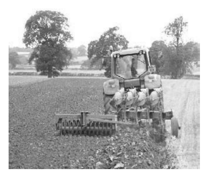
Figure 6, Farming using technology

- The land rights must be adaptable to the development i.e. it must be evolutionary that adapts the change carried by the technology. Particularly, in case of group rights which must be evolvable into the individual rights if an individual can generate the same or even more production than the group by the use of the state of art technology (Figure6).