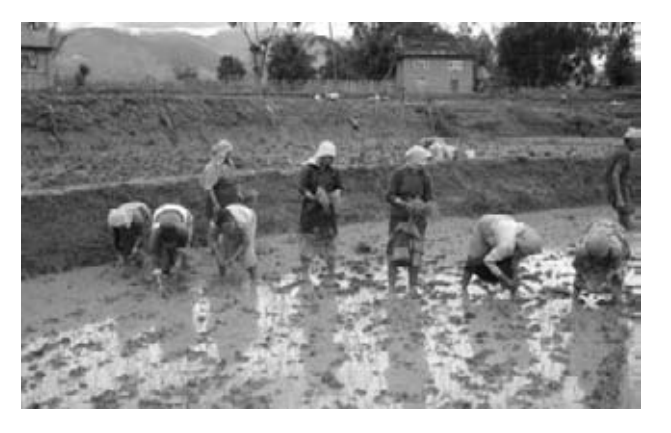
Figure 4, Showing group effort in cultivation