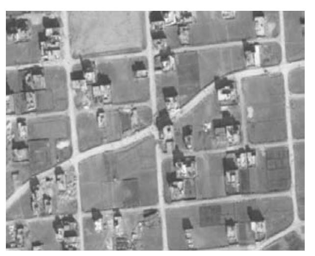
Figure 9, Town Planned area having secure land tenure in Sinamangal, Kathmandu

Lack of land use planning and its implementation cause the urban areas into slums. The more the public lands (green space, road, parks and river etc. but all managed) made availed through planning, the better the environment. The necessary of land zoning can be better illustrated by comparing the following two images of part of Kathmandu area