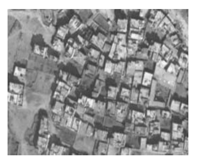
Figure 10, Unplanned area also having secure land tenure in Kapan, Kathmandu shows no road for the interior building

Access to land and Tenure security on the other hand is not the ultimate goal for better humankind. On one hand, people must be able to reap the benefit from the land they are given access to. On the other hand, in the name of accessibility to and ownership on land, they should not be authorized to generate side effect of the legitimate-use (!) in the environment (Figure 11). It means land accessibility for one should not violate the sustainability for the whole (society). It is here the concept of internalization of the externalities should be introduced just to balance the manland relationship by maintaining sustainable usability of land and its resources, through the legitimate restrictions which must be based on legislation and general interest. Controlling over exploitation and legitimate use entails land use planning.