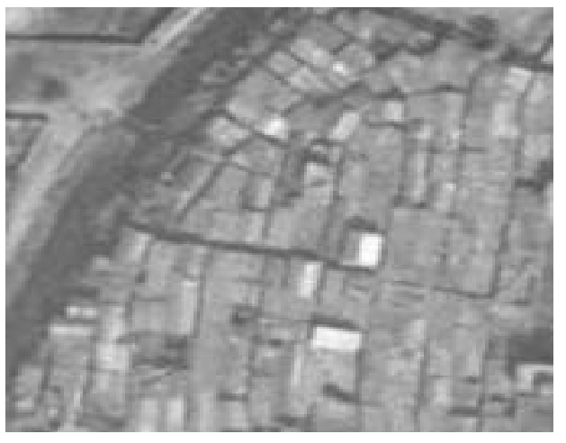
Figure 3, Informal settlement in Kapan 3, Kathmandu, Source: www.google.com