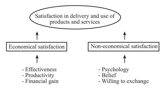
Figure No. 1: Traditional satisfaction concept

Traditionally, satisfactions may be divided into the economical and non-economical satisfactions of the relationships in delivering and using services and products as shown in the figure no.1 (Sanzo et al, 2003).