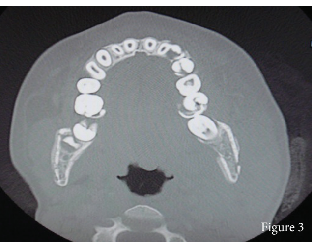
Figure 2 and 3: Axial section CT image (bone window) showing cortical destruction with lamellated type of periosteal reaction in the mandible