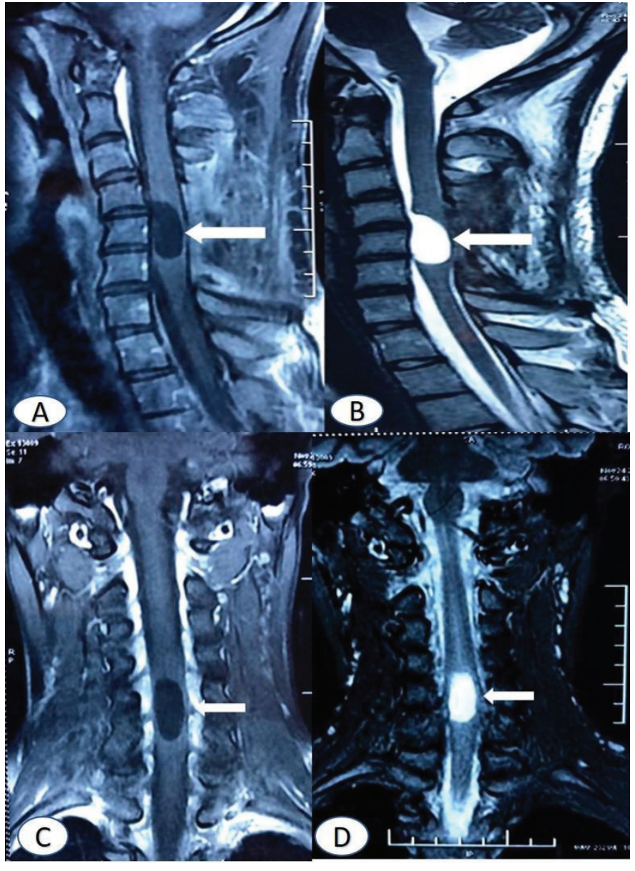
Figure 1: (A) T1W Sagittal image showing cyst (pointed by white arrow). (B) T2W Sagittal image showing cyst (white arrow). (C) T1W Coronal image showing cyst (white arrow). (B) T2W Coronal image showing cyst (white arrow).

extremities with a spastic extension of both lower limbs. His general condition was fair, he had bilateral Hoffman positive, tone- spastic, his muscle power MRC grading was bilateral upper limbs shoulder 3/5, elbow 3/5, wrist 3/5, and fingers 1/5 and for bilateral lower limbs he had a spastic extension. His reflexes were brisk with loss of sensation from C4 downwards, bowel/bladder- retention, gait- bedridden. His modified Japanese Orthopedic Association scale (mJOA) was 4. MRI showed C<sub>4</sub>-C<sub>6</sub> anteriorly located recurrent cystic lesion (Figure 1).