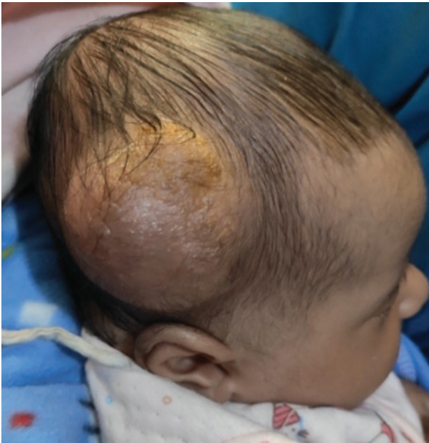
Figure 1: Right parieto-occipital scalp swelling

sent for culture. Escherichia coli was isolated; culture based intravenous antibiotics (Intravenous Cefotaxime) was given for 5 days. She was later discharged on oral antibiotics (Syrup Amoxicillin and Clavulanate). On 1-week follow-up, the wound was found to be completely healed (Figure 4).