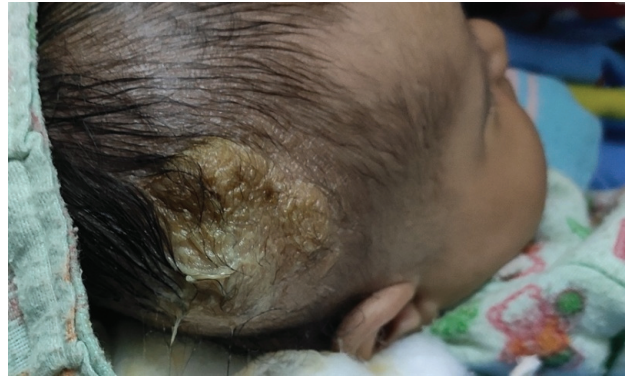
Figure 3: Rupture of previous right parieto-occipital swelling

Occurring in 1-2% of all deliveries, cephalhematoma are caused by traumatic rupture of subperiosteal vessels and