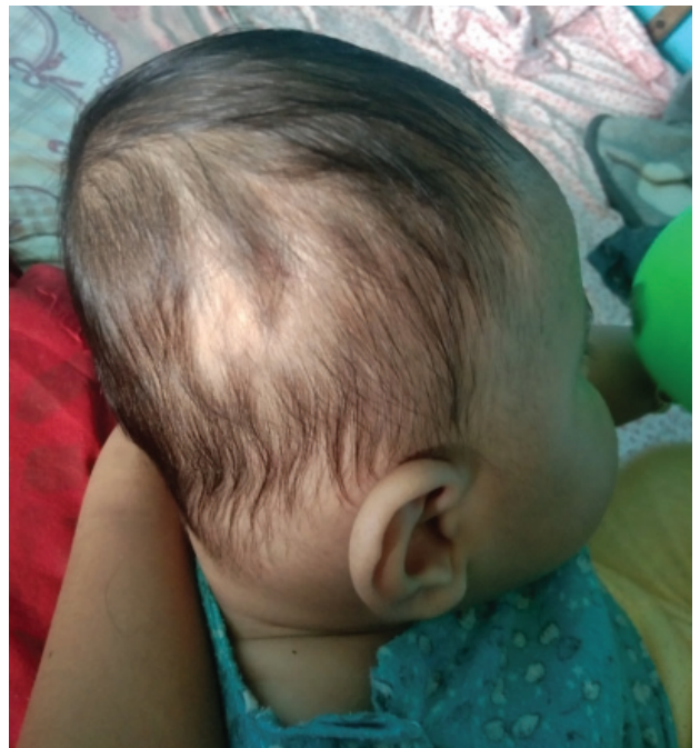
Figure 4: Condition of the index case after 3 months

are more common when the delivery is assisted by forceps, vacuum or scalp electrode. 2,4 Most cephalhematoma resolve spontaneously within weeks and infection is a rare complication. In addition to instrumentation-assisted delivery, risk factors for infected cephalhematoma include neonatal bacteremia with secondary seeding and overlying cellulitis. 4,5 Early infection within the first two weeks of life is often the result of hematogenous seeding, whereas infection of a cephalhematoma after 3 weeks is typically related to an overlying cellulitis. 5 In a retrospective study of 28 cases, E. coli is the most common pathogen isolated from infected cephalhematoma and accounts for 57% of cases. 6 Although other common pathogens are S. aureus and Proteus spp. However, infection due to Group E Salmonella , Coagulase-negative Staphylococcus , Group B Streptococcus , Klebsiella pneumoniae , Streptococcus