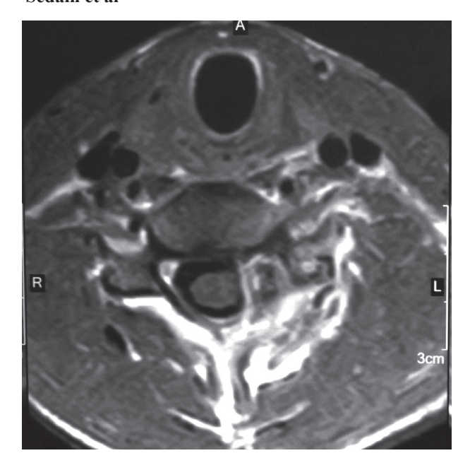
Figure 1: Axial MRI showing heterogeneously enhancing lesion in the left spinal canal with bony involvement and some soft tissue involvement.

but had residual neck pain which improved over a week. Plan is to perform an annual CT spine to see any recurrence.