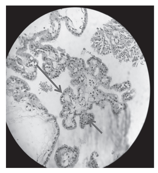
Figure 3: Histopathological picture, long arrow above showing papillary projections and short arrow showing columnar/cuboidal cells (lining epithelium)

CPP is a slow-growing, benign neoplasm that arises from the choroid plexus epithelium. It constitutes about 3% and 0.5% of all intracranial tumors in children and adults respectively.<sup>2</sup> It usually occurs in the first and second decades of life, but has been reported in other age groups also. CPP commonly occurs in the lateral ventricles in children, and in the fourth ventricle in