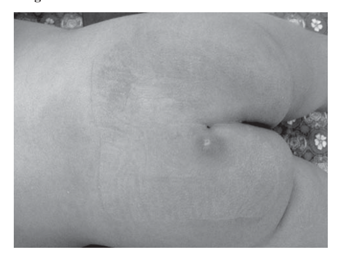
Figure 1: Congenital dermal sinus in the midline of low back. There was associated another sinus just beside that which was discharging pus on and off.