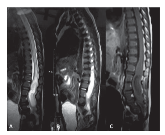
Figure 2: MRI dorsolumbosacral spine, A, B) T2W images C) T1W image showing intramedullary spinal abscess