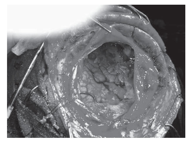
Figure 3: Intraoperative picture showing brain made free from these tight enclosing membrane