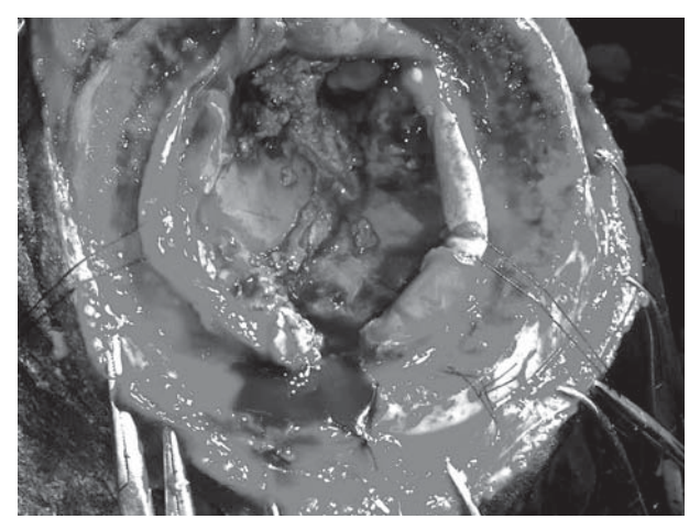
Figure 2: Intraoperative picture showing contents of the hematoma, which included liquefied hematoma with an appearance similar to machinery oil and a solid component similar to golden yellowish colored scrambled egg appearance

The pathogenesis of the formation and development of CSDH is still a matter of discussion. Pathophysiologic processes, such as inflammatory reaction, formation of neomembrane and liquefaction of blood have been implicated.<sup>3</sup> Chronic SDH may completely organize depending upon the time lapse, and may sometime even calcify completely giving rise to a condition termed armored brain or "Matrioska" head (Russian doll).<sup>9</sup>