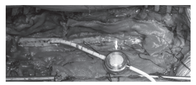
Figure 7: Intraoperative view. Shunt was inserted into dural sac to drain extra CSF.