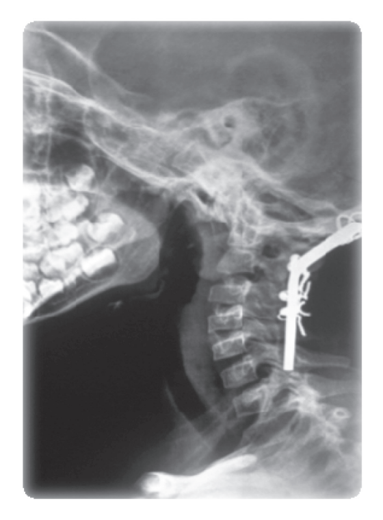
Figure 4 : X ray lateral view of Cervical spine showing implants in situ

The complex anatomy and the unique biomechanics in the region of CV junction made this area a surgical challenge for decades. Dating back to time when Forester first reported the surgical fusion, many historical developments have evolved specially in terms of indications, classifications, operative approaches, instrumentation techniques, and fusion rates with various surgical procedures. The techniques have evolved from simple onlay grafts with or without wire stabilization to more complex futuristic new generation plate/rod hybrid constructs with polyaxial screws in an attempt to maximize patient's benefit in terms of surgical recovery. No wonder, the techniques are growing in complexities and the cost factor ever increasing with each recent development with more or less plateau in the outcome that a procedure has to offer. With newer complex modality, the surgical adjuncts like detailed understanding of 3D surgical anatomy and intraoperative image guidance in order to avoid inadvertent intraoperative injuries are incorporated.