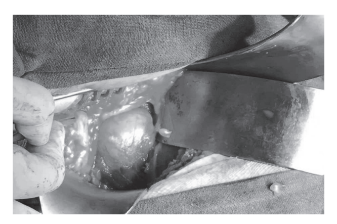
Fig. 2 A Left Transverse incision over left lumbar region and gross total excision of solitary mass was done. Solitary tumor mass of 5x5x4cm encapsulated, firm mass in consistency, white in color, lying over paraspinal exiting nerve root over L3-L5, was seen as shown in figure above.

diffuse reactivity for CD34<sup>4+</sup>, Bcl<sup>2+</sup> and CD99 <sup>4+</sup> and non-reactivity to Beta-Catenin, Desmin, EMA, S-100, SMA. These markers are distinctive feature of SFT.