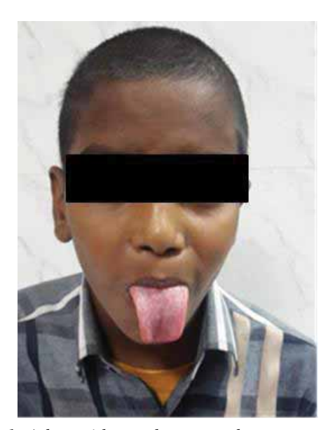
Figure 1: A boy with mouth open and tongue protrusion dystonia.

He was treated with sodium valproate, tetrabenazine, trihexyphenidyl, clonazepam without much improvement. After two weeks of trial with oral medication, he was treated with injection of 40 units of BTx in bilateral genioglossus and lateral pterygoid muscle (10 units each). There was significant reduction in the oromandibular dystonia from grade 4 to 2 at three months follow up, with improvement in swallowing. Hyperintensities in the thalami had also regressed in size on repeat brain MRI at three months follow up.