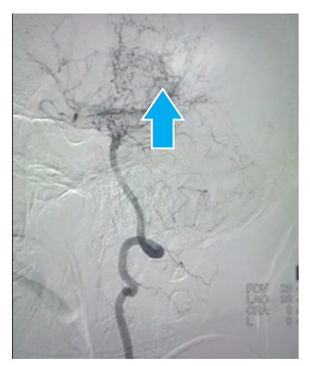
Figure 3: Digital Subtraction Angiography image showing absent anterior and middle cerebral artery replaced by multiple small network of vessels showing puff of smoke appearance.